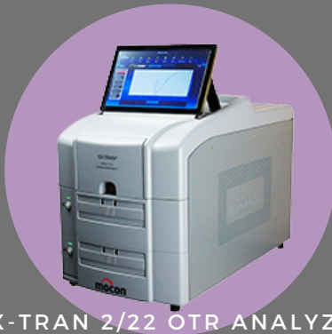
OX-TRAN 2/22 OTR ANALYZER