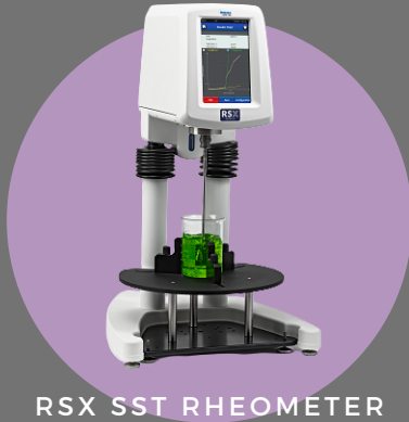
RSX SST RHEOMETER