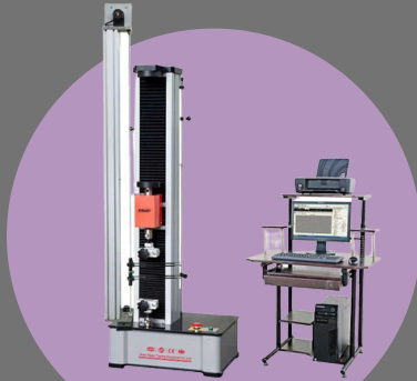
SINGLE COLUMN TESTING MACHINES