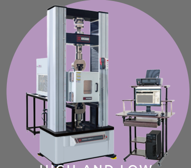
HIGH AND LOW TEMPERATURE TENSILE TEST