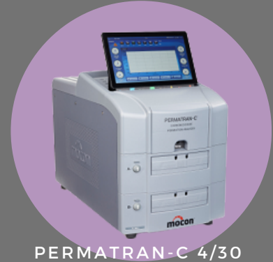
PERMATRAN-C 4/30 ANALYZER