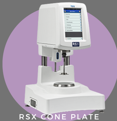
RSX CONE PLATE RHEOMETER