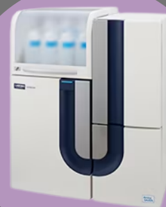
HIGH-SPEED AMINO ACID ANALYZER