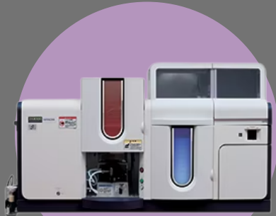
POLARIZED ZEEMAN ATOMIC ABSORPTION SPECTROPHOTOMETER