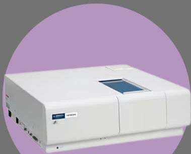
SINGLE BEAM SPECTROPHOTOMETER