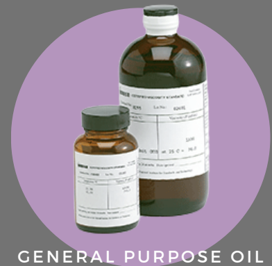
GENERAL PURPOSE OIL