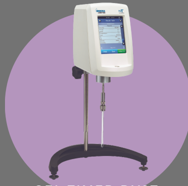
GEL TIMER DV2T INSTRUMENT