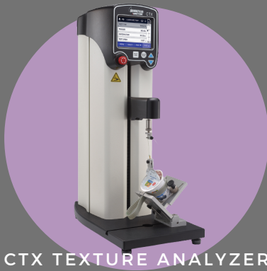
CTX TEXTURE ANALYZER