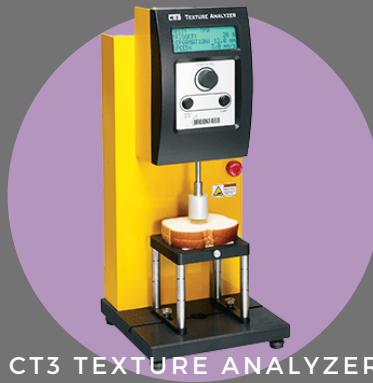
CT3 TEXTURE ANALYZER