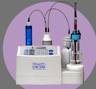
HIRANUMA AUTOMATIC TITRATOR COM-300A