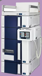
HIGH-PERFORMANCE LIQUID CHROMATOGRAPH