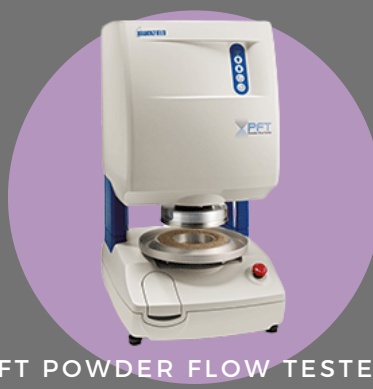
PFT POWDER FLOW TESTERS