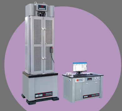
STEEL STRAND TEST MACHINE