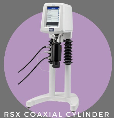
RSX COAXIAL CYLINDER RHEOMETER