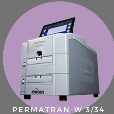
PERMATRAN-W 3/34 WVTR ANALYZER