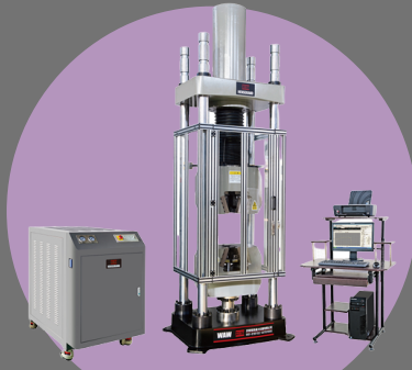
SINGLE SPACE TENSILE TESTING MACHINE