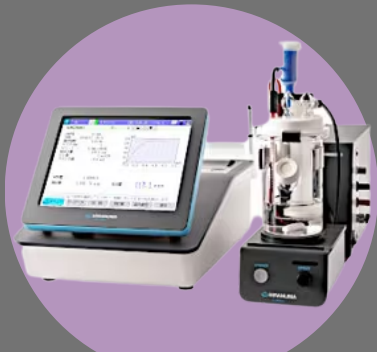
HIRANUMA COULOMETRIC KARL FISCHER TITRATOR