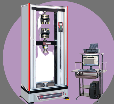
DOUBLE COLUMN TESTING MACHINES