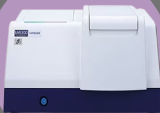
DOUBLE BEAM SPECTROPHOTOMETER